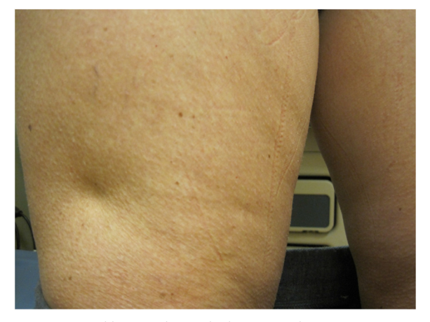
Fig. 3 Improved lipoatrophy on thigh in December 2014

In the past, CSII was reported to treat lipoatrophy induced by human insulin [26]. Today, lipoatrophy induced